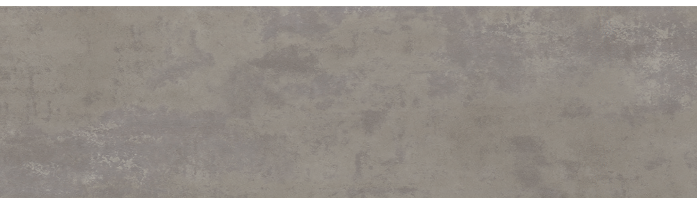
9967 | Warm Concrete