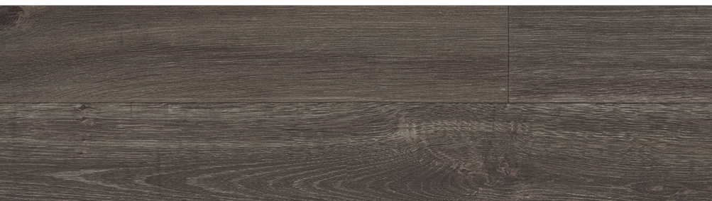
9963 | Smoked Oak