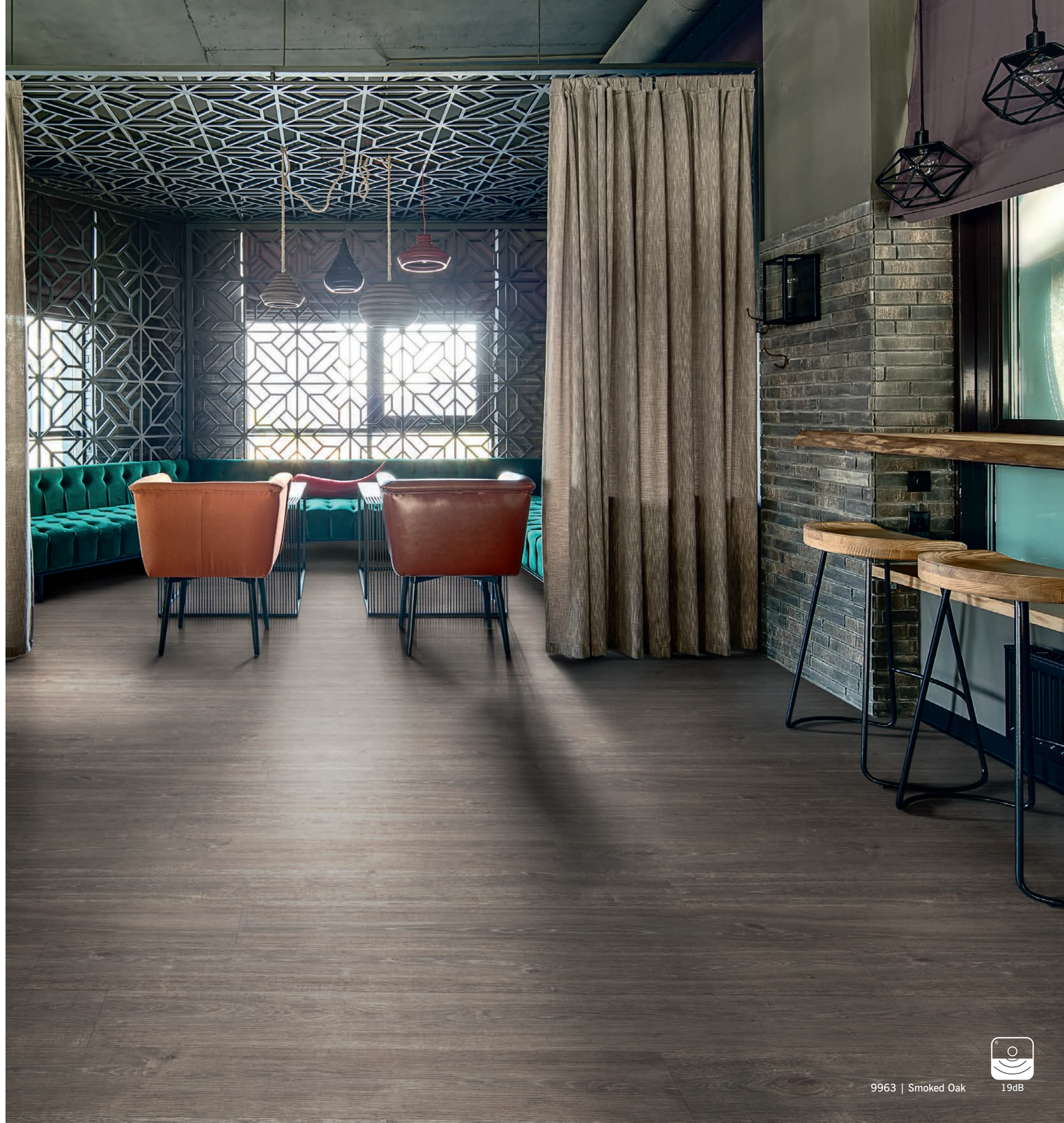
9963 | Smoked Oak