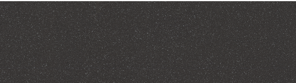
9974 | Jet