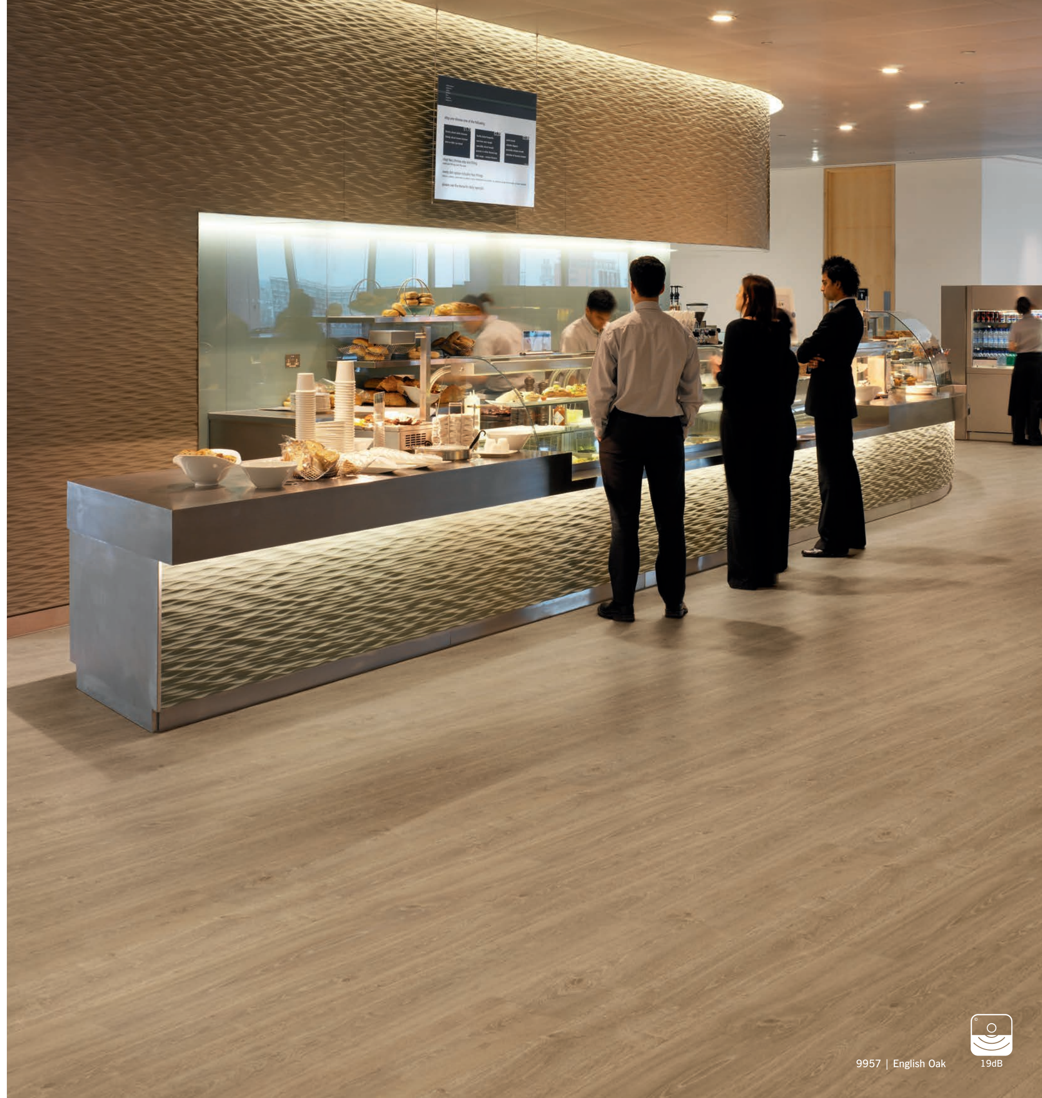
9957 | English Oak