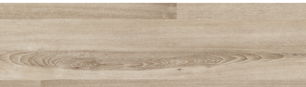
9953 | Warm Limed Ash