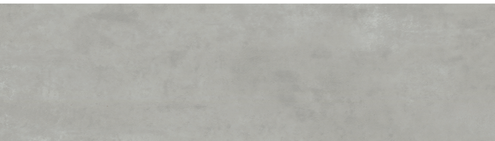
9965 | Light Grey Concrete