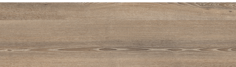
9954 | Roasted Limed Ash