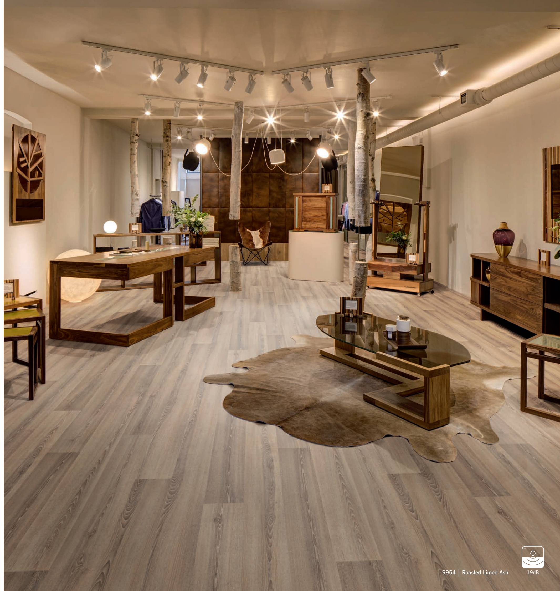
9954 | Roasted Limed Ash