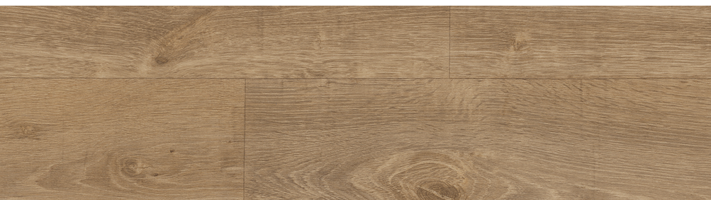
9957 | English Oak