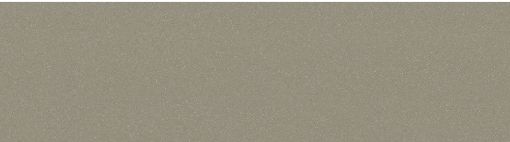
9975 | Moleskin