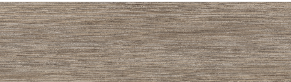
9985 | Honey Beige