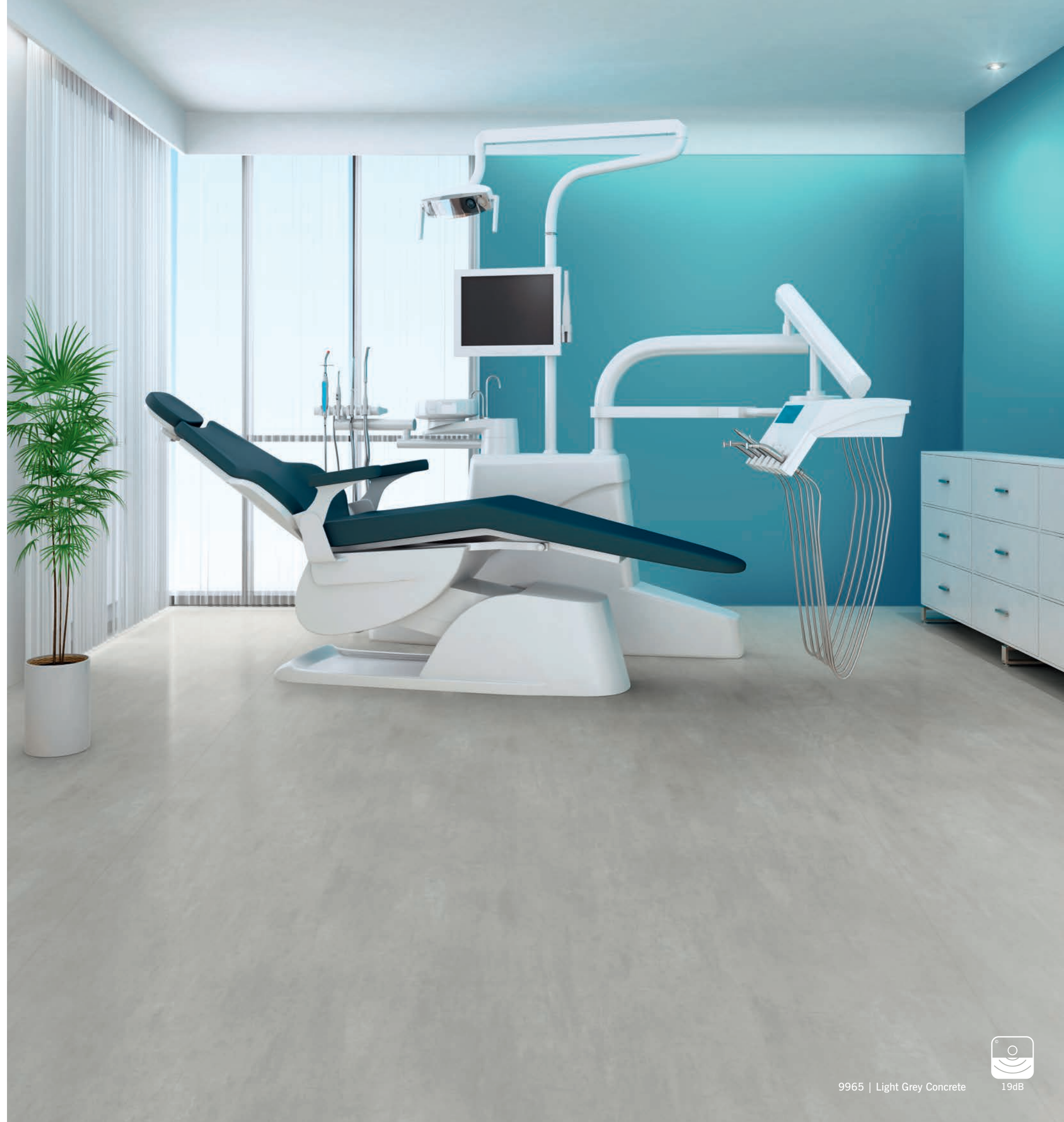
9965 | Light Grey Concrete