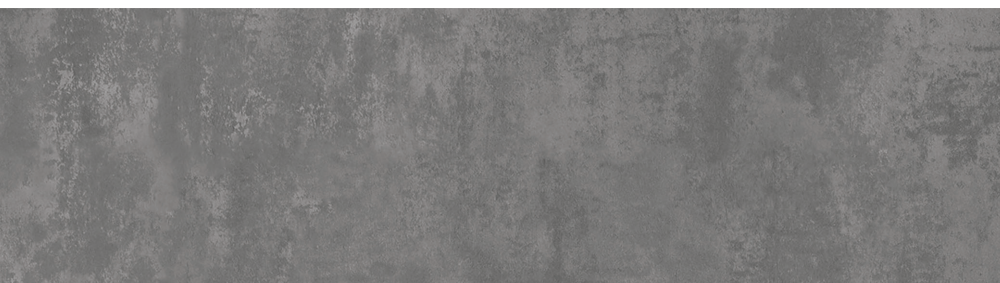
9966 | Cool Concrete