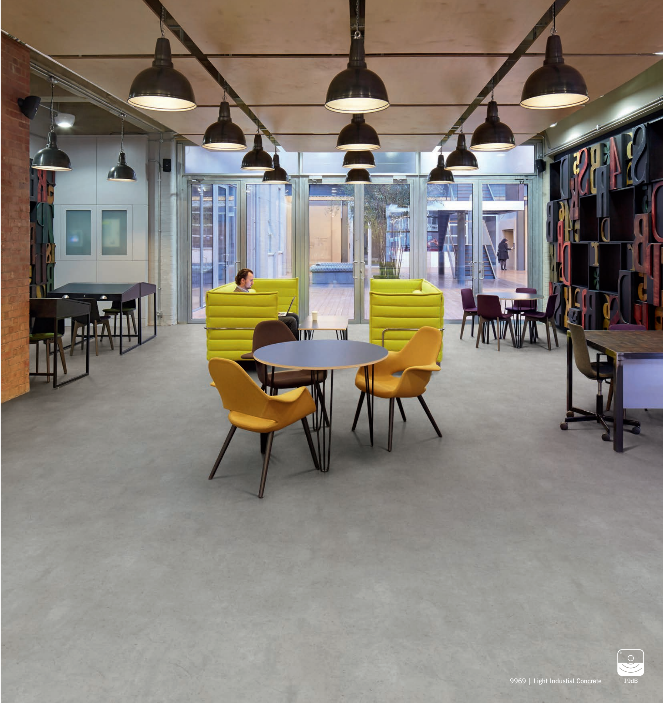
9969 | Light Industrial Concrete