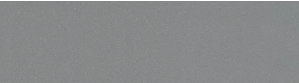
9973 | Storm