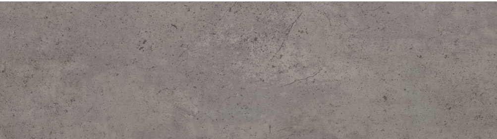
9970 | Dark Industrial Concrete