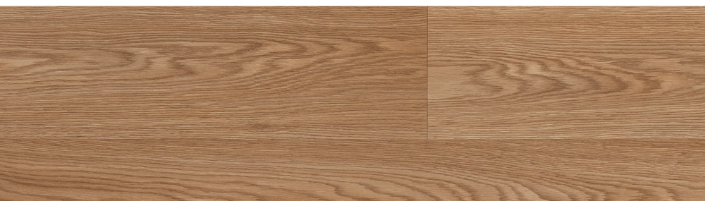
9959 | Honey Oak