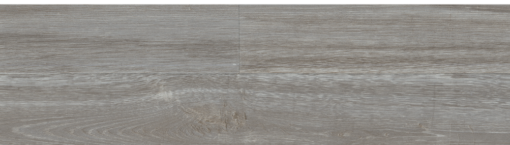
9951 | Silver Oak