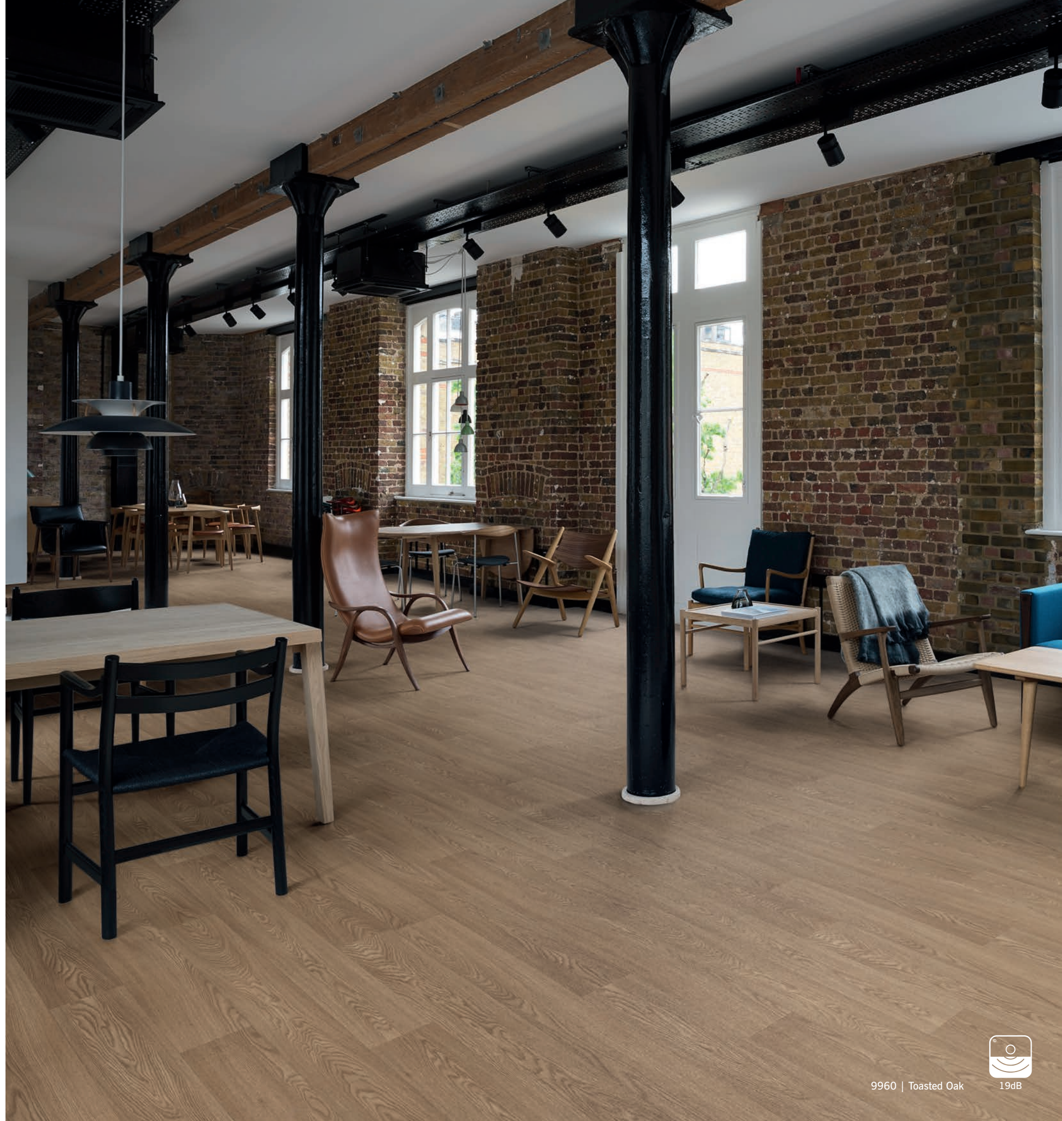
9960 | Toasted Oak