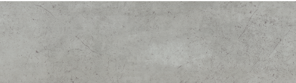
9969 | Light Industrial Concrete