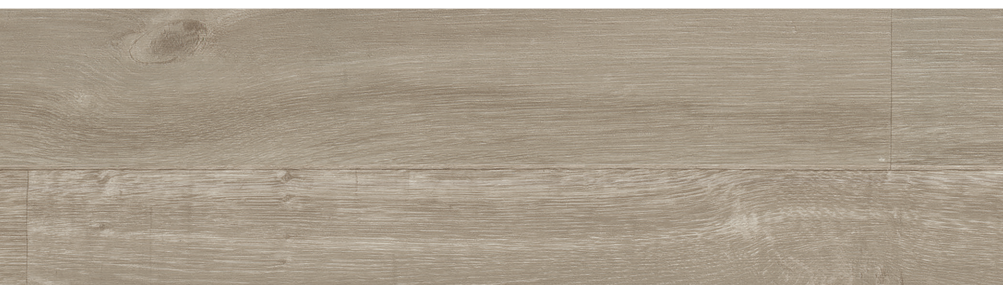
9952 | Sun Bleached Oak