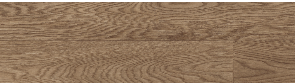
9960 | Toasted Oak