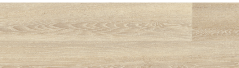
9955 | Classic Limed Ash