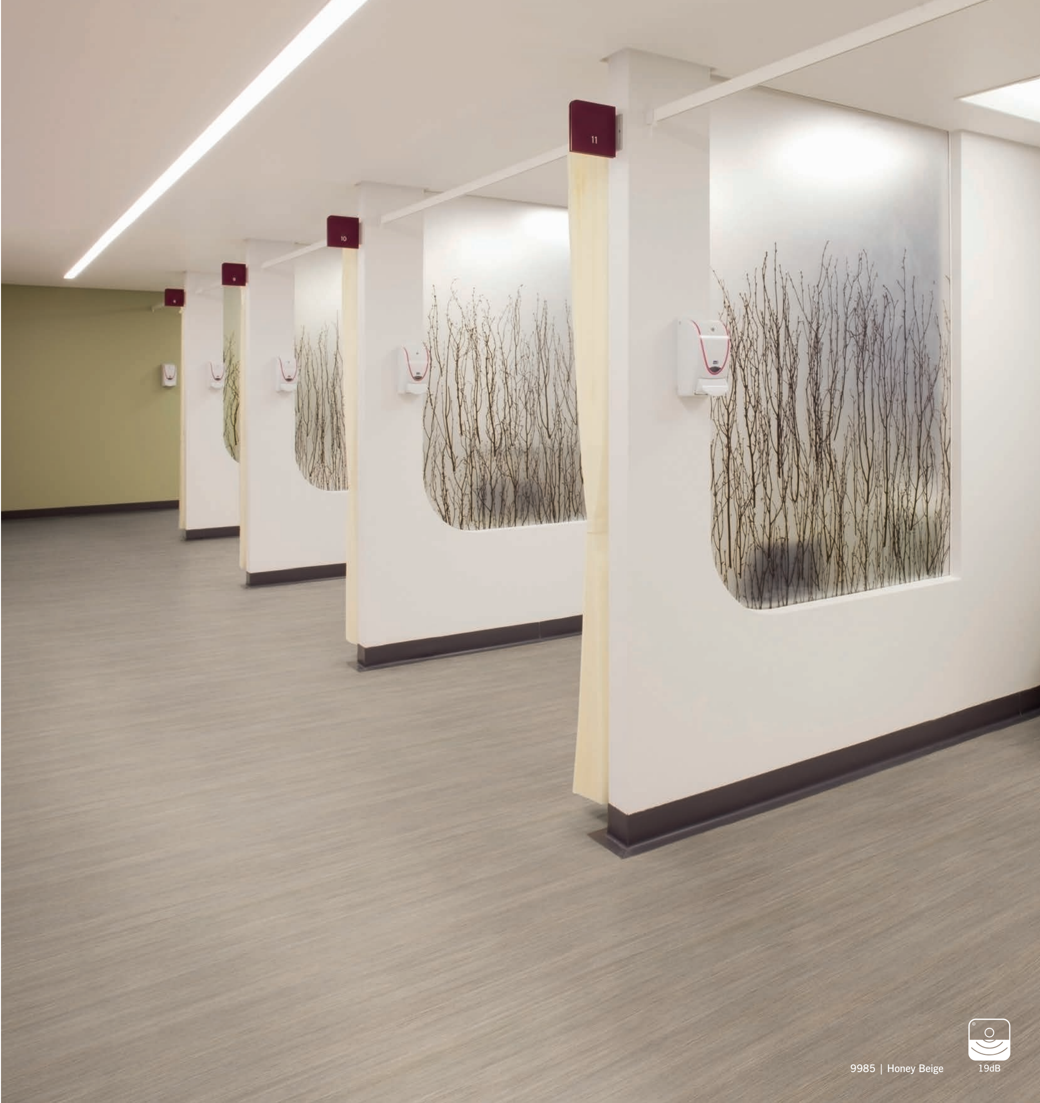
9985 | Honey Beige