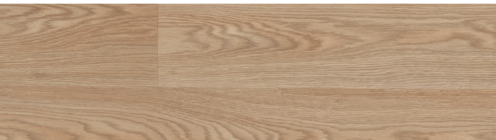
9956 | Blond Oak