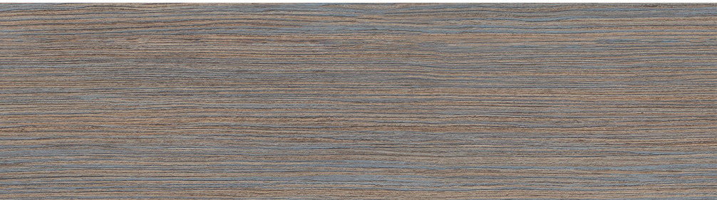
9986 | Autumn Rain