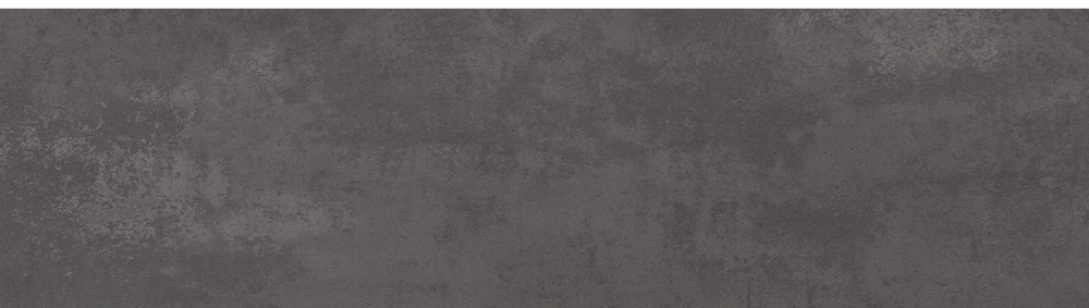
9968 | Dark Grey Concrete